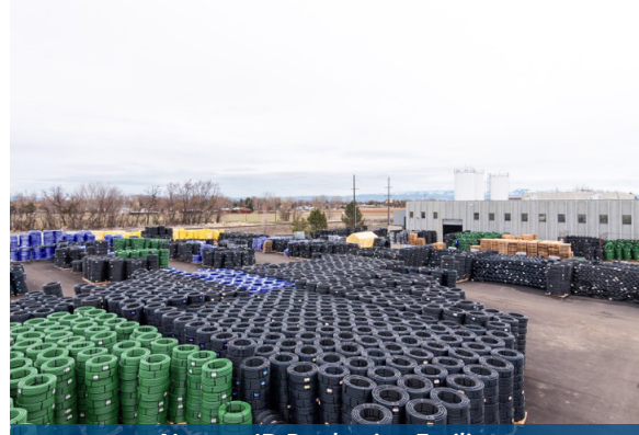
Nampa, ID Production Facility

We invite you to give us the opportunity to prove that Centennial Plastics offers quality and service that soars.