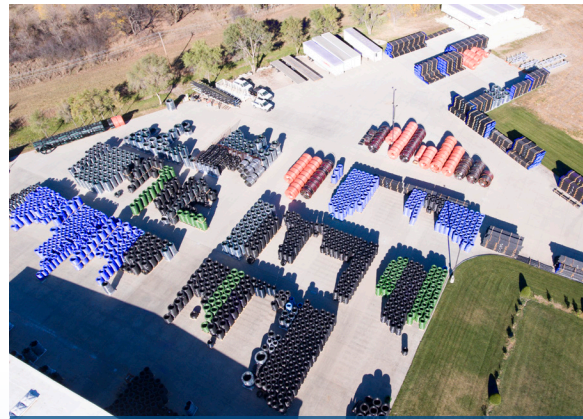
Hastings, NE Production Facility & Headquarters